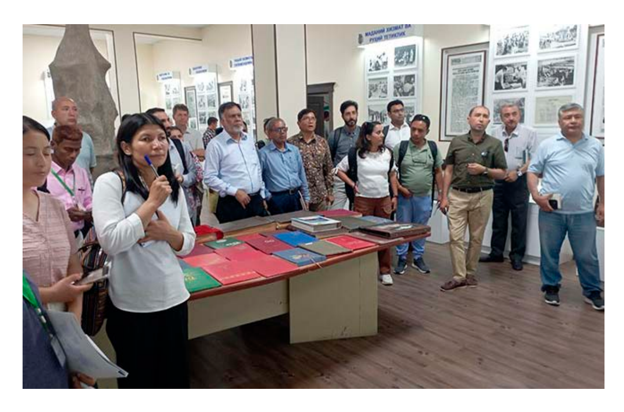
Museum at the Fergana Valley Main Canal Operation Authority