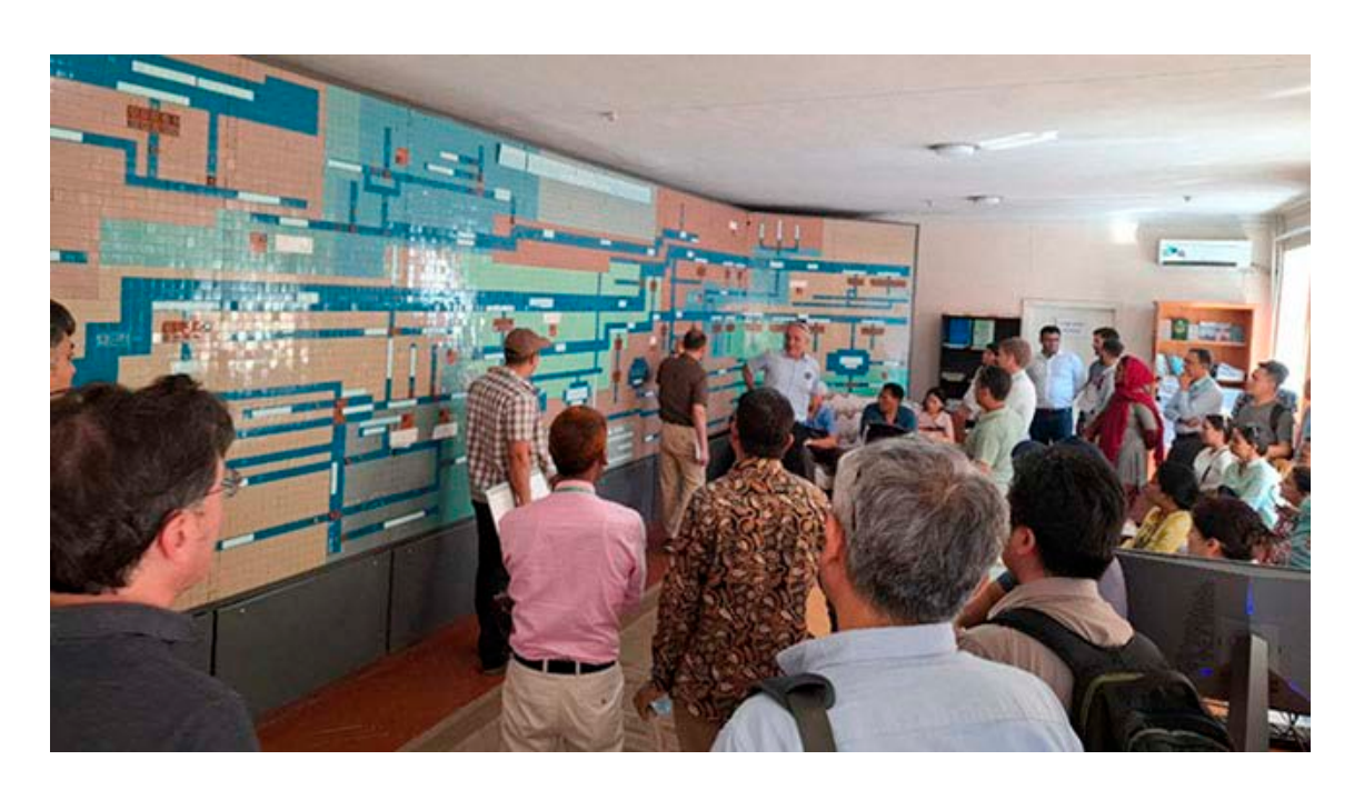
Control center of Syrdarya-Sokh